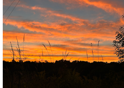
Last sunset of Summer 2023