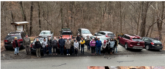
1st Day Hike at King/Potter 1/1/23