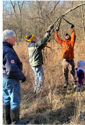
Apple Tree Rehab at Morosini 2/18/23