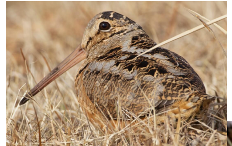
Woodcock Walk 3/18/23