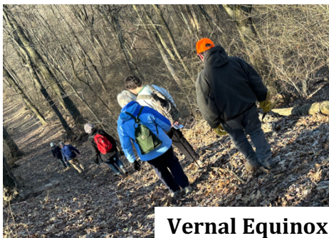
Vernal Equinox/1st Day of Spring at McGinnis