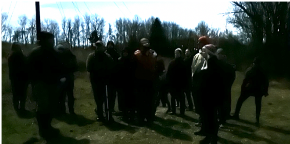
Owl Prowl at Morosini