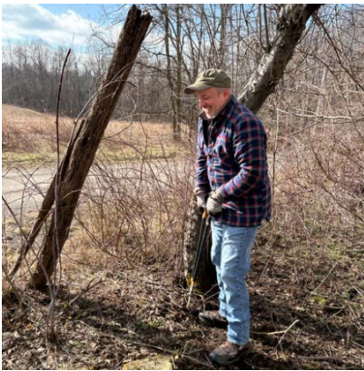
Pruning Apple Trees at the Morosini Reserve