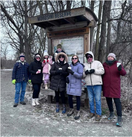
Hot Chocolate Hike with Murrysville Recreation Dept at Morosini