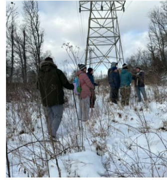
First Day Hike at the King Reserve