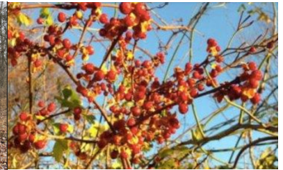
OptOutside at the McGinnis Reserve 11/26