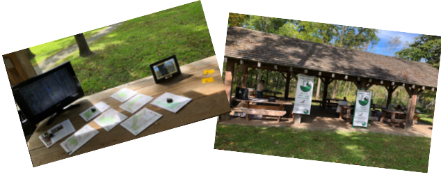
30 th Anniversary Celebration 10/02/2021