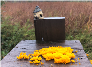
10/16 Autumn Enchanted Forest