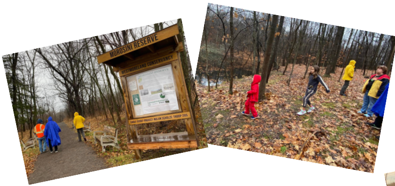
Hot Chocolate Walk 12/11 w/Murrysville Recreation