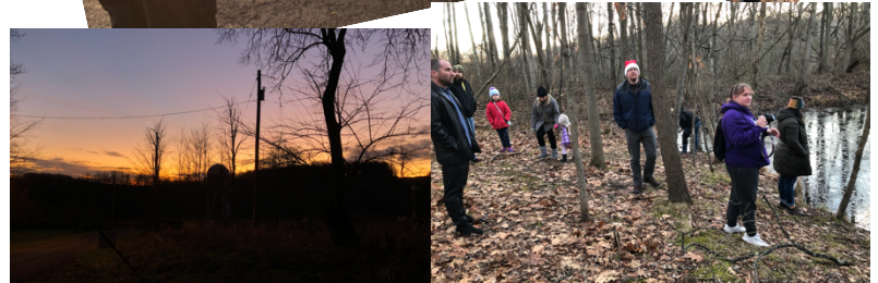
Winter Solstice Walk 12/21/2021

Westmoreland Conservancy Reserves are privately owned lands that are open to the public. PLEASE observe Leave No Trace sensibilities and take out anything you take in . Do NOT leave trash at the reserves.